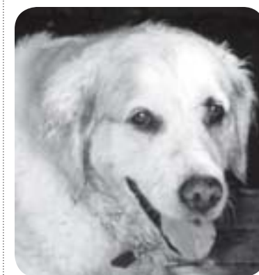
Kiwi 13 AZ - 25 AZ

This issue is dedicated to the memory of Kiwi, a devoted companion and a beloved friend.