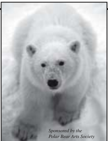
Sponsored by the Polar Bear Arts Society