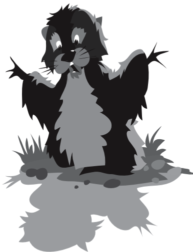
Ogilvie T. Groundhog, 25 AZ POPS

determinants" of accurate prognostication. In a surprising act of solidarity, the other candidates condemned as "hogwash" his claim that the ability to predict the beginning of Spring with precision was something "built into" or "encoded in" only the descendants of E. Bromley Groundhog. "Dartmouth Groundhog has dug himself a hole from which he will never be able to ascend," said Winchell Woodchuck, who acted as spokesanimal for the group. Not long after, Dartmouth Groundhog withdrew his name from the race, but many believe that his candidacy served as a "shot in the arm" to the flailing election campaign. The Park's Office of Statistics declared that a full 85 per cent of eligible voters turned out to vote for the candidate of their choice. Shortly after the results were